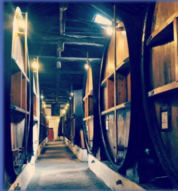
“Lello & Irmão”