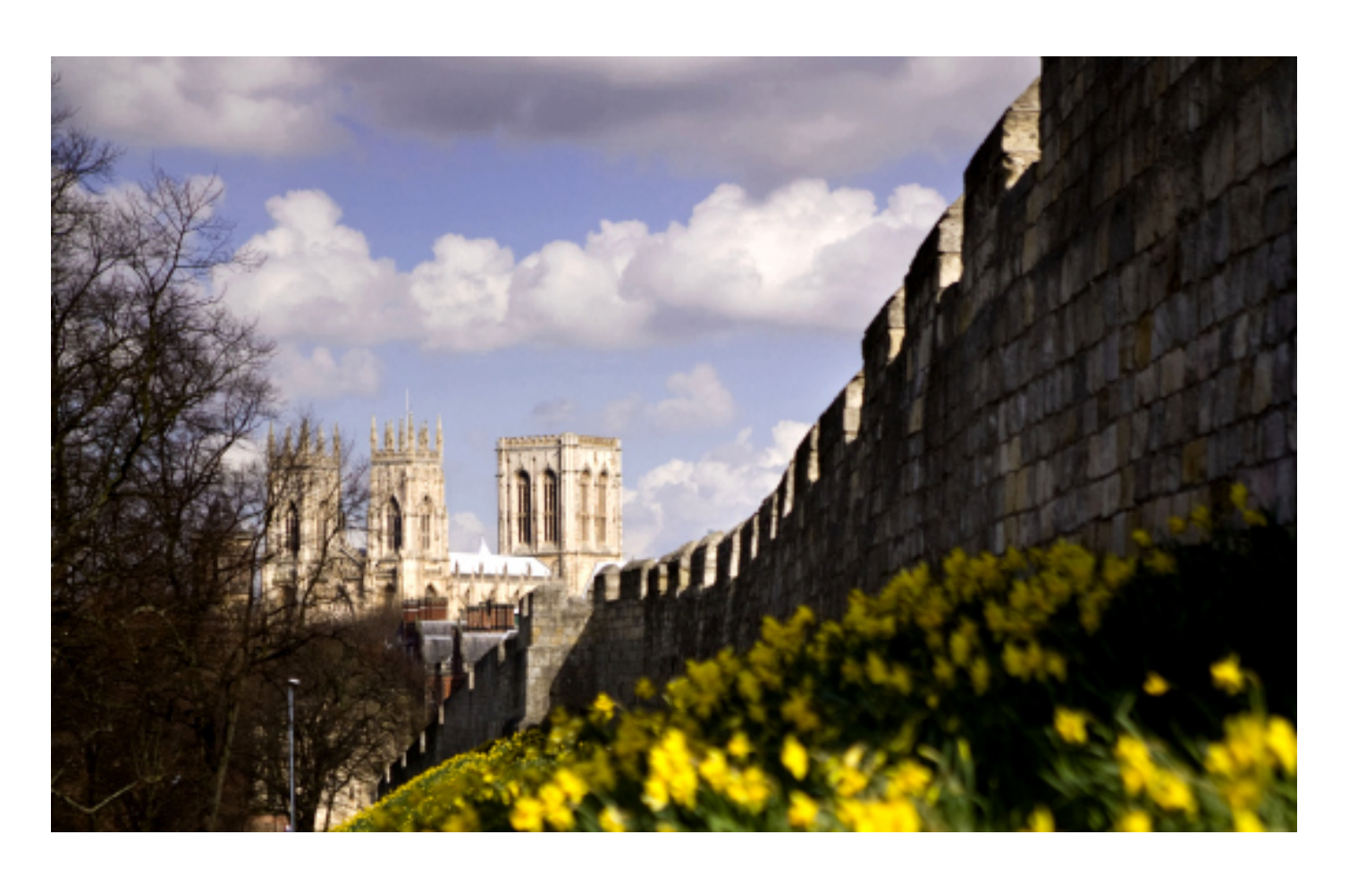
Historic walled city with Roman and Viking influence