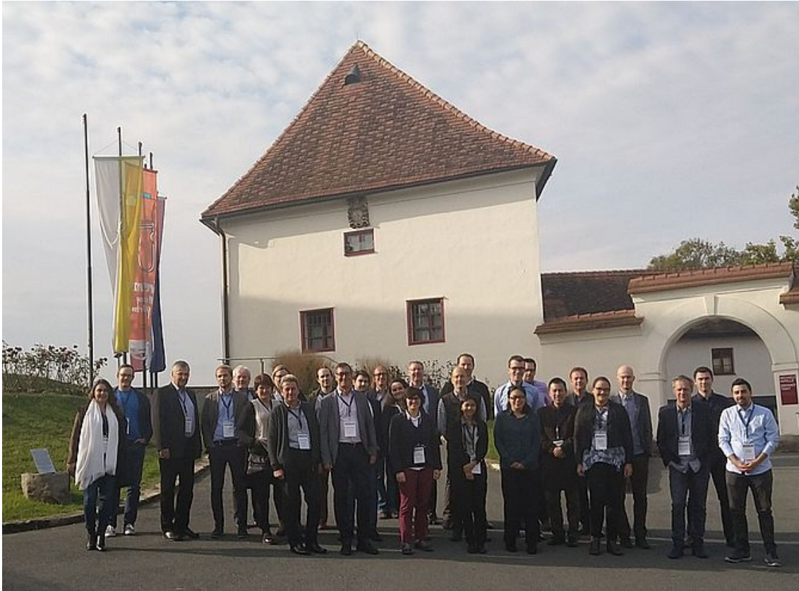
Group photograph of the 85 th IUVESTA workshop participants in Schloss Seggau, Austria