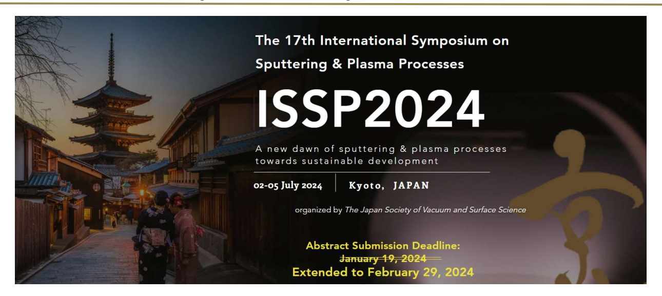
Conference organized by the Japan Society of Vacuum and Surface Science

Union Internationale Pour La Science, La Technique et Les Applications du Vide International Union for Vacuum Science, Technique and Applications Internationale Union für Vakuum Forschung, Technik und Anwendung