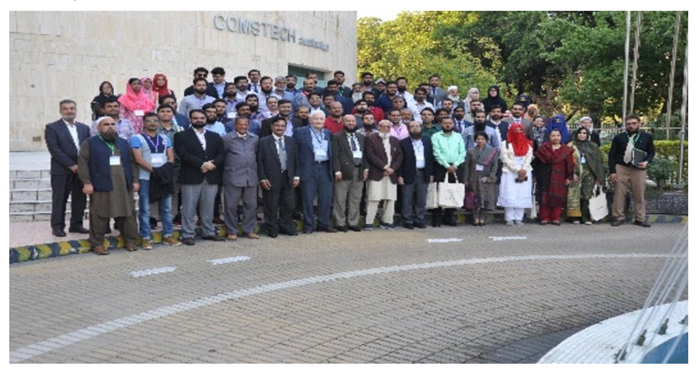
Group photo of the course participants

A cultural program and a main PVS dinner were a part of the program. The following organizations sponsored the event: IUVSTA, PSF Islamabad, IVC Islamabad, EPRF Karachi, QA Sialkot, IE Gujranwala, and NINVAST, etc.